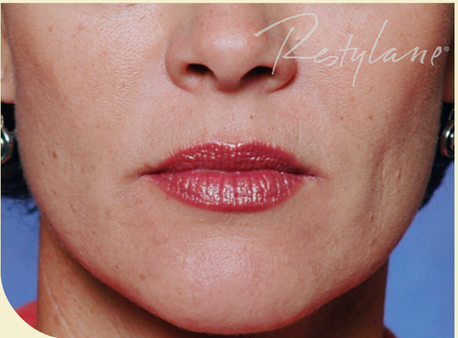
After treatment with two Restylane ® 1 mL syringes