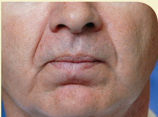
Nasolabial folds before treatment