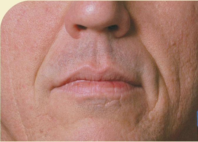
Nasolabial folds before treatment