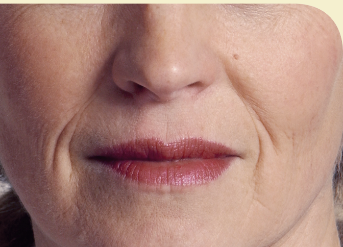
Nasolabial folds before treatment