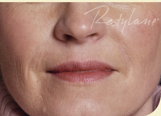
After treatment with three Restylane ® 0.7 mL syringes