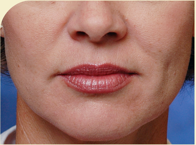
Nasolabial folds before treatment