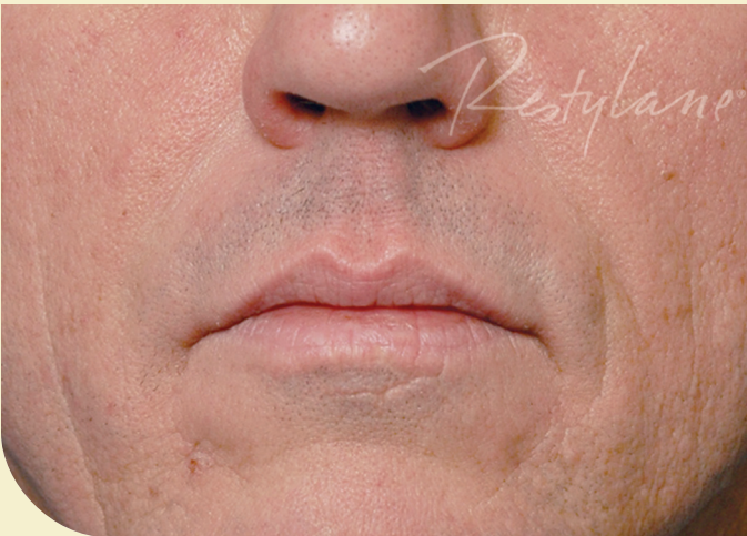
After treatment with two Restylane ® 1 mL syringes